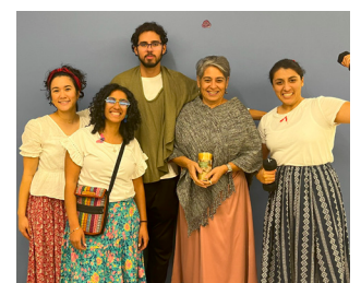
CORE Action Team