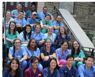
Community Health Promoters