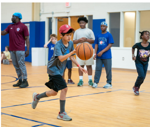
The CORE Fitness