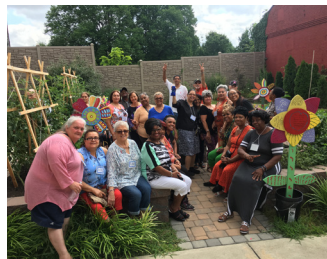
Young at Heart Seniors Program